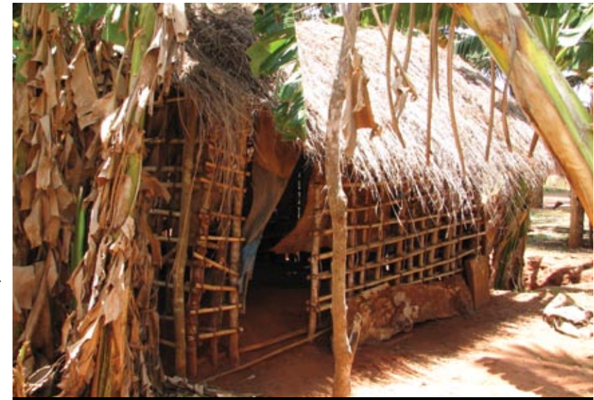
Open-air home among banana trees, typical of southern Tanzania and northern Mozambique, offers little protection from lions.

Education may be useful, too; it is simply not a good idea to walk alone at night. And certainly, friends should never allow friends to walk home alone drunk in the dark—lions seem to have a particular fondness for drunks. But then they also catch the simple and delusional outcasts: