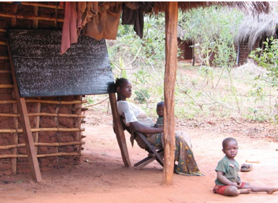
Mother and two of her children relax outside their home in Nampunga, Tanzania—without any barrier against intrusive wildlife. Arabic prayers cover the blackboard.

Web links related to this article can be found at www.naturalhistorymag.com